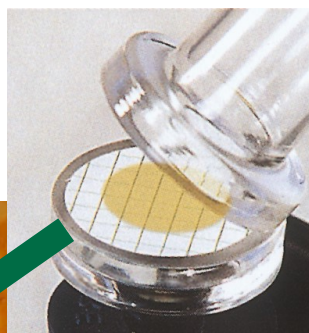
Naked eye view showing varnish